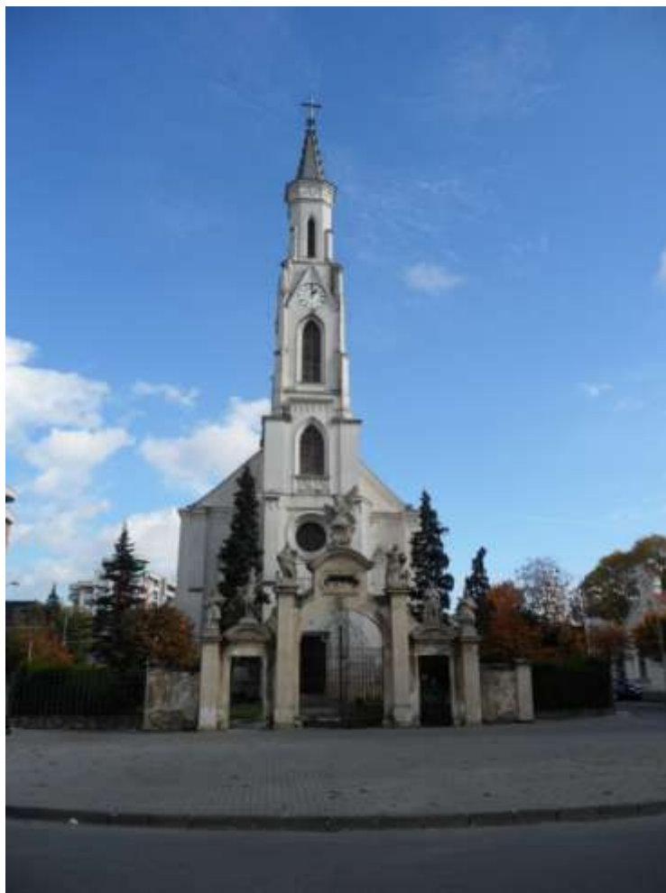
Saint Peter and Paul Church

The last Catholic Church in this presentation is Saint Peter and Paul Church . The present day Neo-Gothic church was built between 1844-1848. In this case, the deviation measured with the iPad compass is 22^{\circ} but with a regular compass is 30^{\circ} . The church is in a middle of an avenue and it is located parallel with the two parts of it.