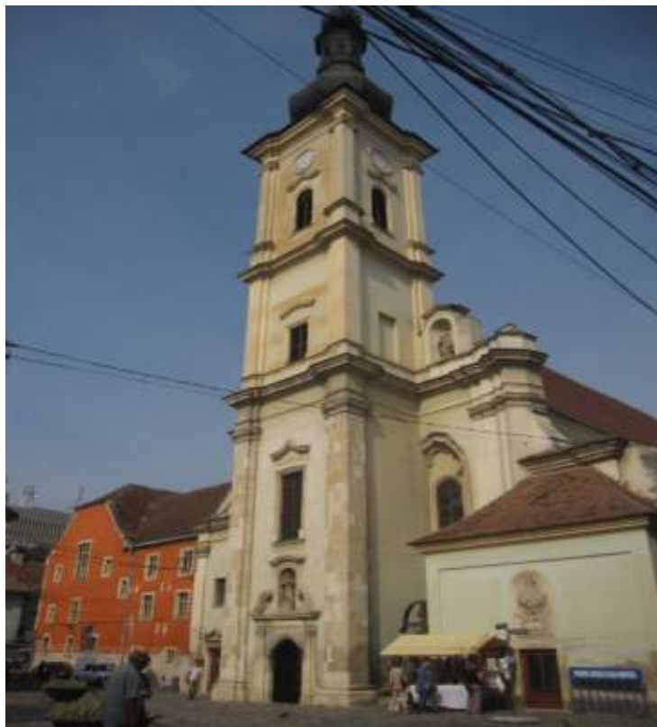
The Franciscan Church

Then we visited the Franciscan Church, which was built between 1260 and in the tardo – roman style. This is the oldest catholic church from Cluj Napoca. Its orientation is deviated with 9^{\circ} from the right direction.