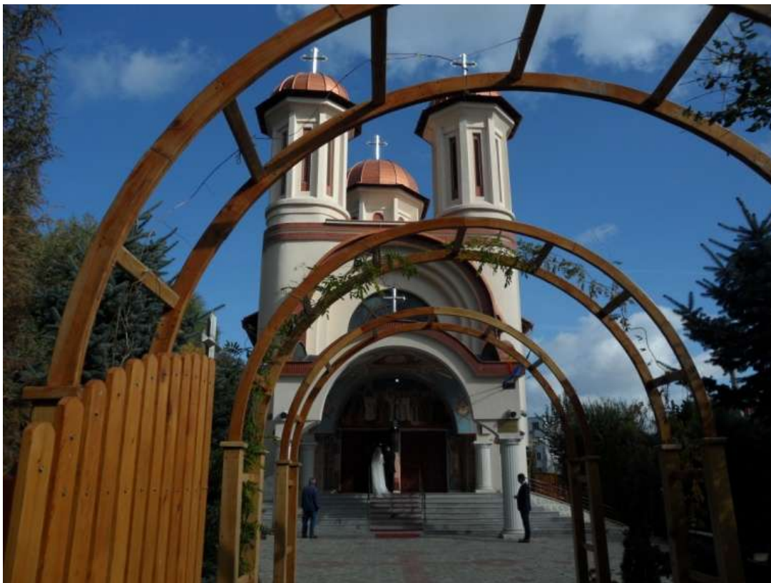
The Exaltation of the Holy Cross Church

The Exaltation of the Holy Cross Church is not oriented east – west because the deviation is 48^{\circ} . This is due to its location along the street.