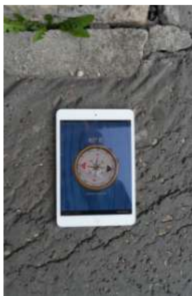
The St. Michael Church