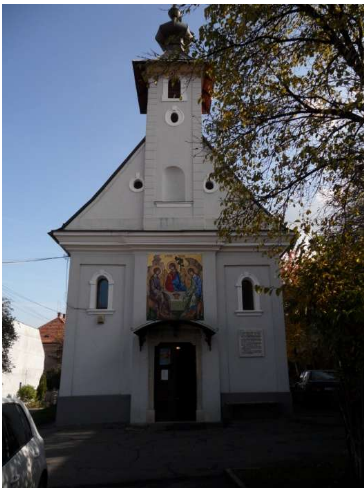
The Holy Trinity Church

The Holy Trinity Church is the first Orthodox Church from the city. It was built in 1796 in baroque style.