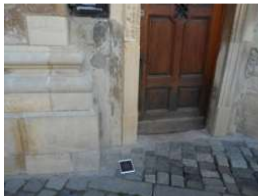
The compass near the Franciscan Church