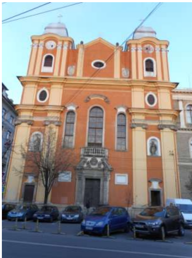
The Piarist Church

The next church is the Piarist Church or the University Church, dedicated to the Holy Trinity. It was finished in 1725 as the first baroque church from the region.